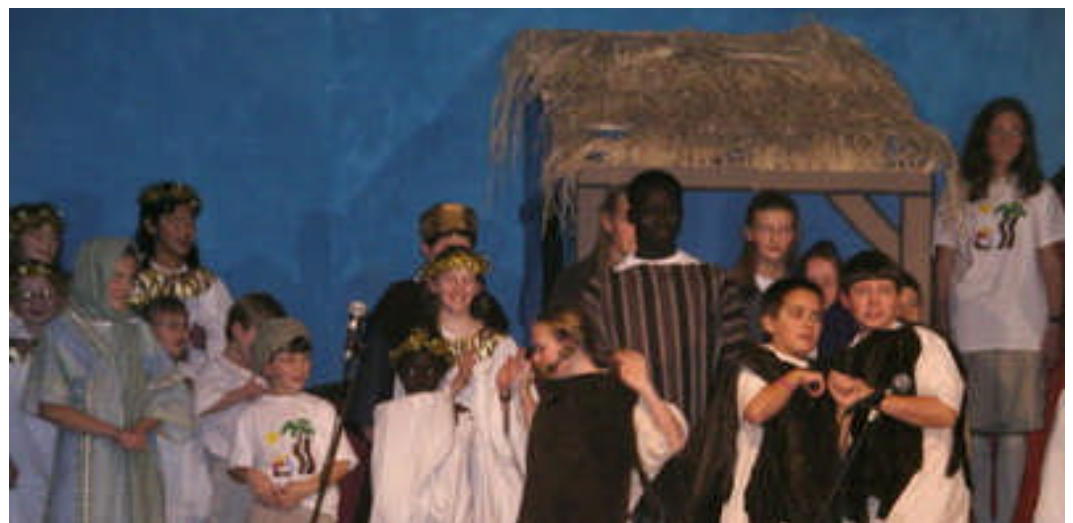
Play Finale.